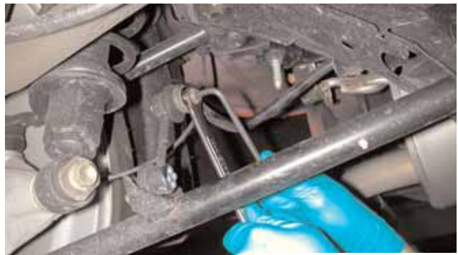
Illustration 2 cont.

2. Using a 5mm Allen wrench and a 14mm combination wrench, remove the nuts attaching the top of the anti-sway bar end links to the anti-sway bar. Remove the end links from the anti-sway bars. Using a 12mm combination wrench, remove the nuts that secure the anti-sway bar brackets to the vehicle. Remove the anti-sway bar. Illustration 2.