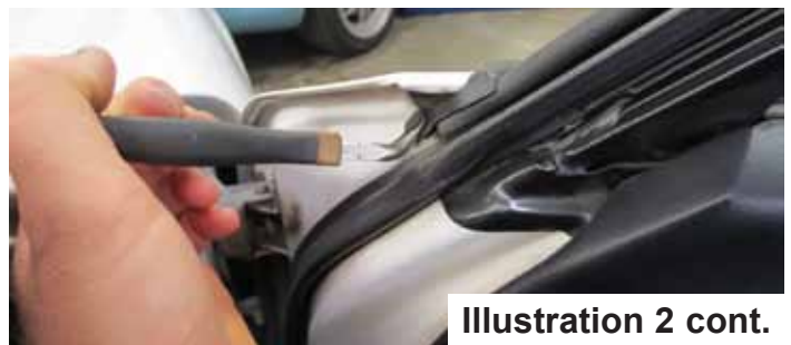
Illustration 2 cont.