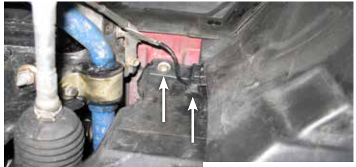
Illustration 1 cont.