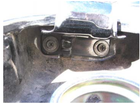
Fig. 1 – Hinge Screws

1) Begin by popping open the stock fuel door and removing the gas cap temporarily. Locate the two retaining screws that attach the door hinge to the body as shown in Figure 1. Remove these screws using a Phillips screw driver or 8 mm socket. Store the screws with the original lid or reinstall in the original threaded holes.