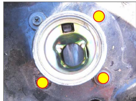
Fig. 2 – Filler Neck (Front of car to the left)

2) Proceed to remove 3 of the 4 filler neck retaining screws as shown in Figure 2 using a Phillips screw driver or 8 mm socket. Store screws for use in next step.